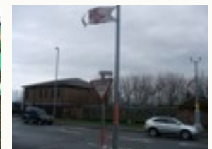
how can communities police interfaces