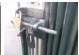
interface communities are often locked in and locked out of society