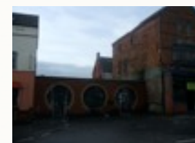
interfaces divide and conquer local communities

This course aims to provide participants with a basic understanding of conflict issues within a divided, or contested, community. It will develop leadership skills and knowledge in local people living in areas of weak community cohesion. Through a process of communicative action participants will develop an understanding of how to inform and influence local peace building activities, to transform interface communities, by residents, for residents.