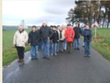
Peace Builders from North Belfast who participated in the course pilot programme visit the Somme

Peace Building in Interface Communities has been developed by LINC (Local Initiative for Needy Communities), NBIN (North Belfast Interface Network), Intercomm and the Edward de Bono Foundation through the Developing Leadership Community Empowerment Programme and North Belfast Conflict Transformation Forum, in partnership with QUB School of Education.