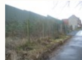
all interfaces are different.

This 10 session course is designed to explore issues relevant to transforming conflict in cross-interface communities in North Belfast. Through a process of Transformative Learning participants will develop a basic understanding of the knowledge and skills required to develop and sustain peace building activities in interface communities by working in partnership with residents, PSNI and statutory agencies.