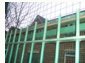
interfaces affect peoples health

Understand how local residents can influence processes of local governance and develop key leadership skills.