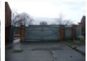
interfaces protect and divide.